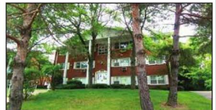
MLS#1408057-LAKE GENEVA: Enjoy the Lake Geneva lifestyle. Perfect location, walking distance to downtown. Recently updated kitchen, bathroom, newer flooring throughout, freshly painted. .... $76,900.