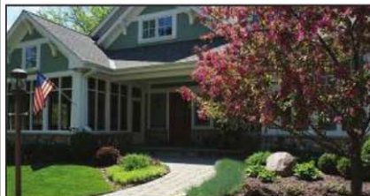
MLS#1410174-FONTANA: Stunning 5BR home located in Glenwood Springs steps to the lakefront. 3 levels of custom finishes w attention to detail throughout. Finished LL offers wet bar, family rm that walks out to patio. .... $1,399,000.