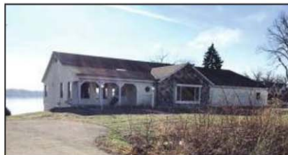
MLS#1422692-POWERS LAKE: Attention developers, builders or individuals this unique R-4 zoning allows up to 4 units on this parcel. Located on 152' of Powers Lake in Honey Bear Bay..... $675,000.