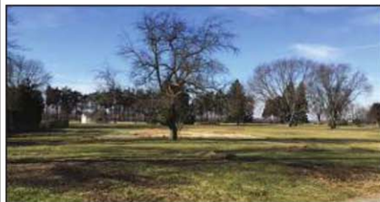
MLS#1397091-POWERS LAKE: Captivating views and 50' on Powers Lake. Bring your plans and build in Honey Bear Bay Estates. Lot is wider at bldg. site to accommodate a larger residence..... $375,000.