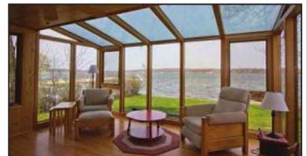
MLS#1362860-TWIN LAKES: Adorable chalet on Lake Elizabeth with 60' of frontage. Knotty pine interior, hardwood flrs, 1st flr master suite, lakeside sunroom that leads out to the deck & bonus room over the garage. .... $475,000.