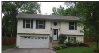
MLS#1392843-BLOOMFIELD: Nippersink Gem! Spacious living, 4BR, 2 BA, entertaining deck, fenced yard, perennial gardens. Close to golf, Lake Benedict, and the state line..... $149,900.